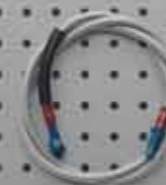
MHR BRAKE HOSE