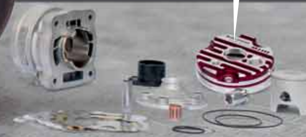
NEW GRUPPO TERMICO FLANGED MOUNT TESTA ROSSA Ø 52