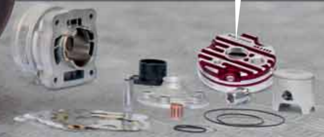
FLANGED MOUNT TESTA ROSSA CYLINDER KIT Ø 52