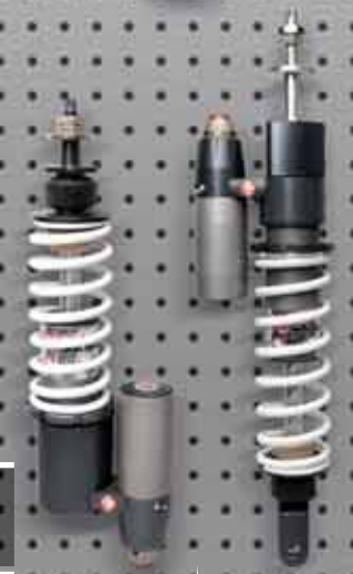
SHOCK ABSORBER PAIR RS24/10-R FRONT/REAR