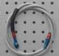
MHR BRAKE HOSE