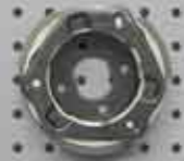
PRIMARY GEARS HTQ z 16/37

PASSION TECHNOLOGY EXPERIENCE THE WINNING FORMULA.