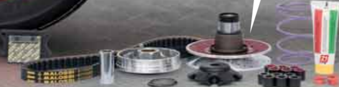
OVER RANGE MHR ALUMINUM