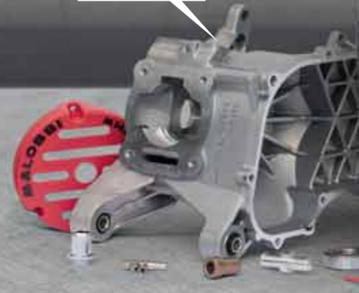
RC / ONE